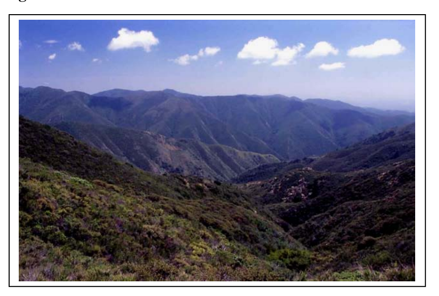
The chaparral of Trabuco Canyon where the last California grizzly bear in Southern California was killed in 1908.